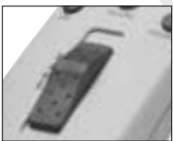
4-position switch for single-handed operation.

REVERSE OF PRODUCT (not shown): 2 PROGRAMMABLE BUTTONS