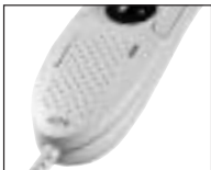
Built-in loudspeaker for audible feedback.